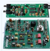
Kits and Modules